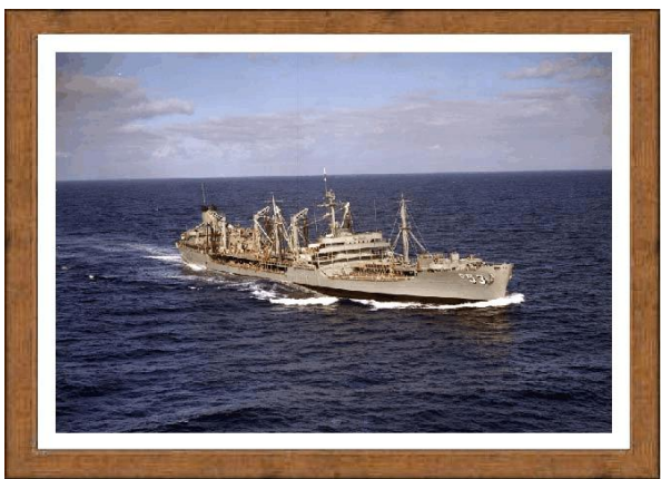
USS CALIENTE AO 53