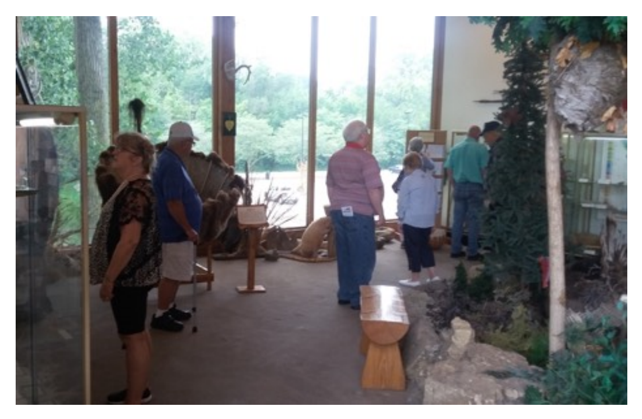
Reunion attendees look over exhibits at the Lewis and Clark Boathouse Museum.