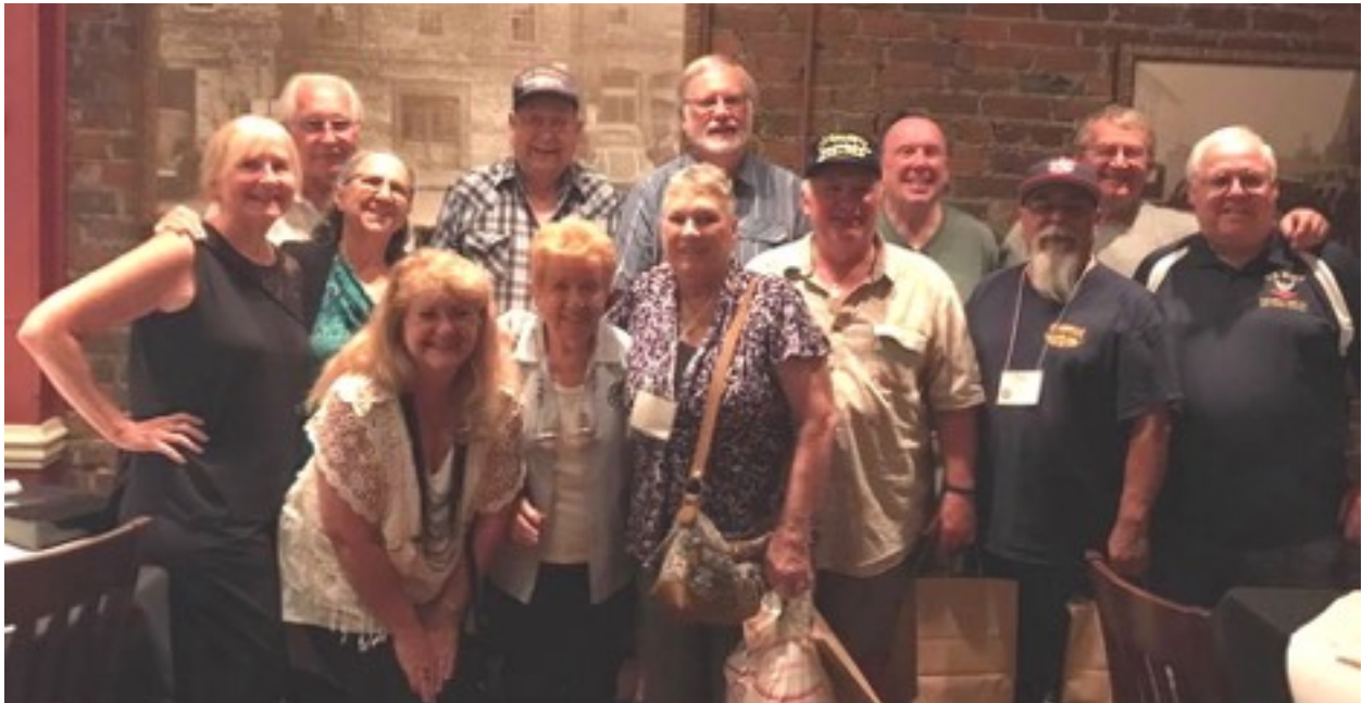
Carlitos Mexican Bar and Grill, a couple doors down from the hotel, was a popular place for dinner Monday night. Above are some of the attendees who enjoyed food and camaraderie there. The restaurant closed just under a month after the reunion in preparation for reopening in a new location in January.