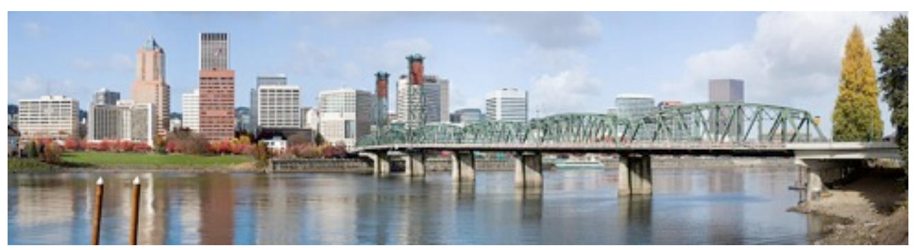
Downtown Portland from east side of Willamette River south of Hawthorne Bridge.

The agenda for the reunion will be similar to those of past reunions. Pat Hurton has done a great job in lining up a tour for Friday. There are two parts to the tour: a morning tour of the city and an afternoon ride up the Columbia River. Here's a short description of the tour: